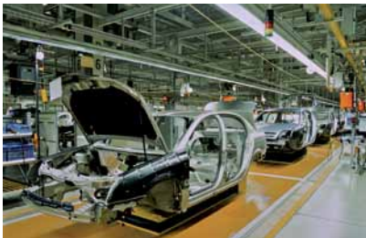
Stamping plant / body work