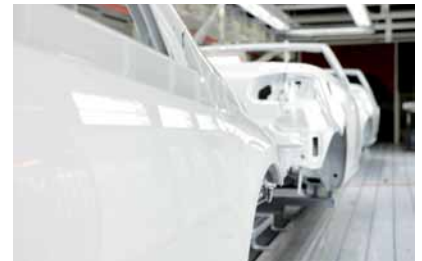
Clear coat / STARCKE FINISHING SYSTEM