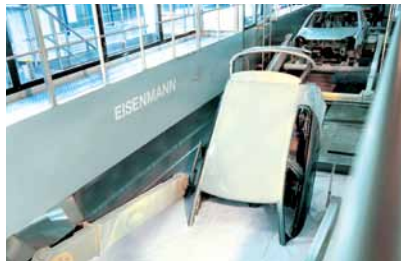
E-coat / primer